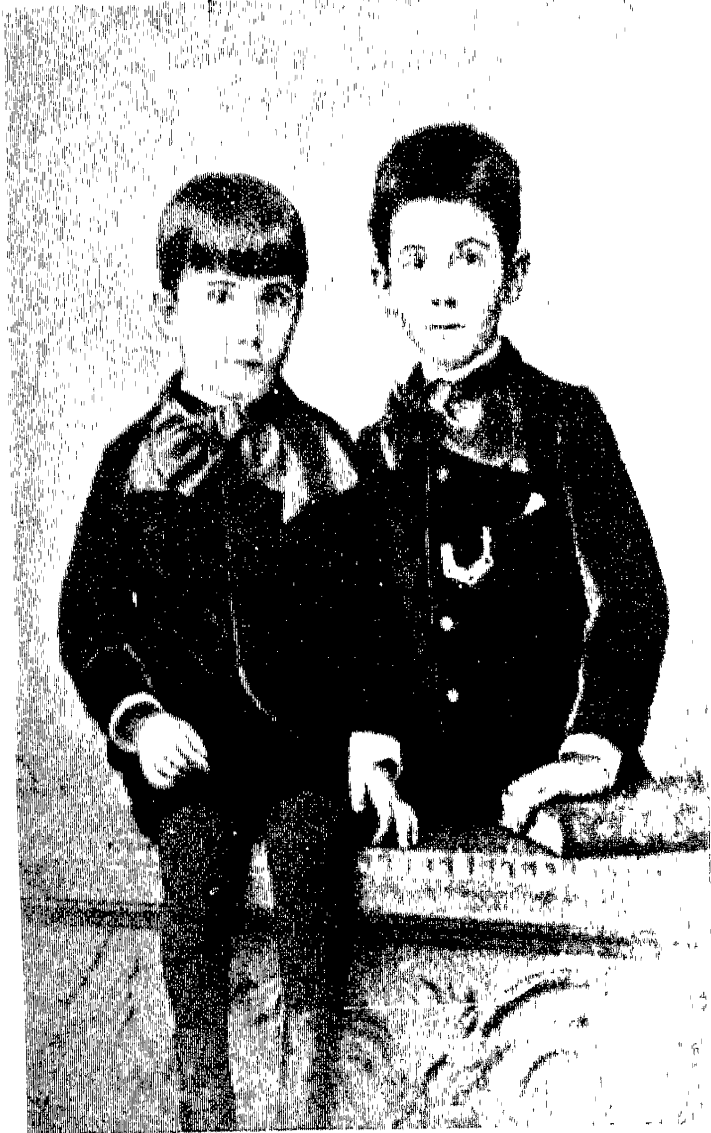
STEFAN ZWEIG AS A BOY, WITH HIS BROTHER, RIGHT